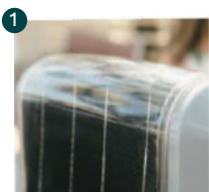
180° Solar Power