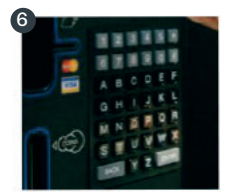
Registration Plate Entry optional