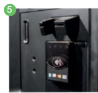
Chip & Contactless